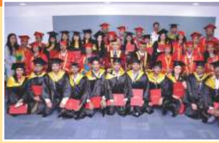
Convocation Ceremony for the batch of 2013-14 at IIPH-Delhi on 31st July 2014