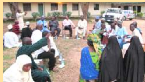
Open Air debriefing meeting at the district Head Quarter, Birnin Gwari, the terrorist affected LGA of Nigeria