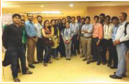
IIPH Gandhinagar organised its Alumni meet on 15 October 2014